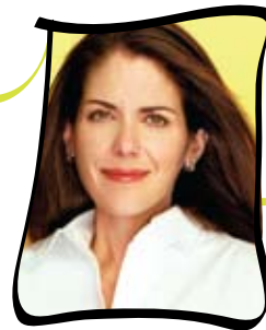
Jean Chatzky March 23, 2010