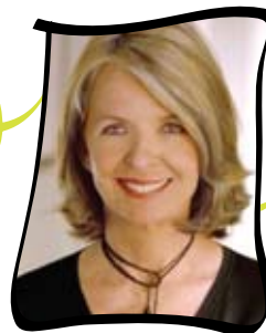
Diane Keaton May 11, 2010