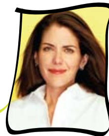
Jean Chatzky Money 911 (March 23, 7:30pm)

Experience an intimate connection with five extraordinary women.