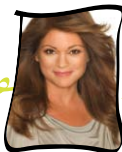
Valerie Bertinelli January 26, 2010