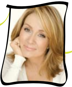
Patricia Heaton March 15, 2010