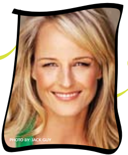
Helen Hunt May 26, 2010