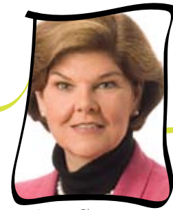
Ann Compton February 25, 2010