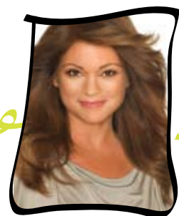
Valerie Bertinelli January 27, 2010